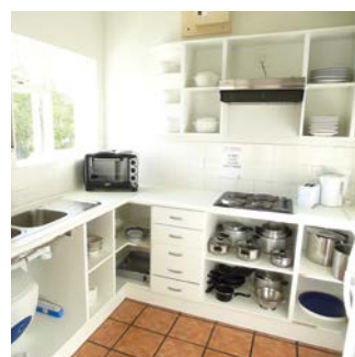
The communal kitchen